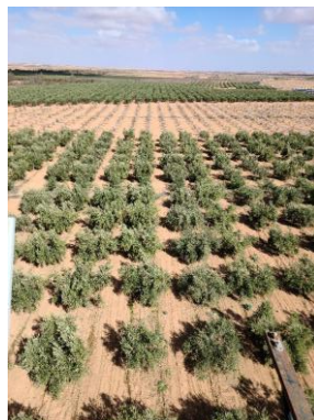
Figure 1: Tower with the radar instrumentation illuminating the olive grove